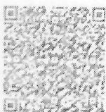
Registrar Pharmacy Council